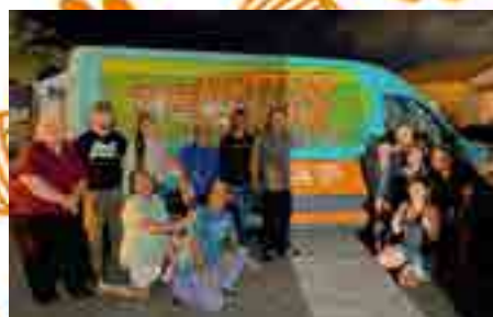
Ten Lives Club teams up with Best Friends Animal Society to rescue cats from Hurricane Ida