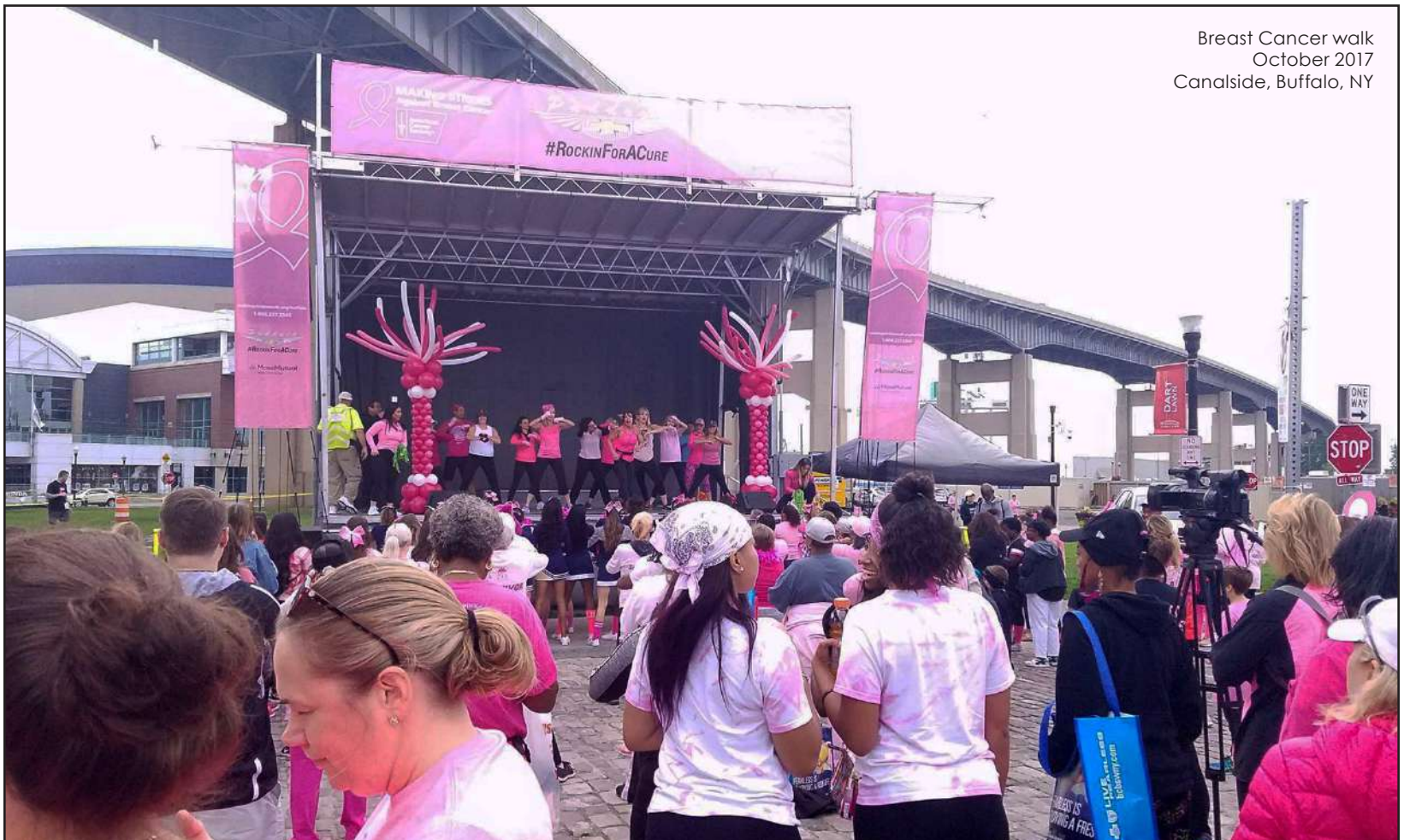
Breast Cancer walk October 2017 Canalside, Buffalo, NY

Be on the lookout for the Your HWH team at these events. We hope to see you there supporting these amazing causes and our community!