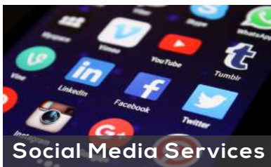
Social Media Services